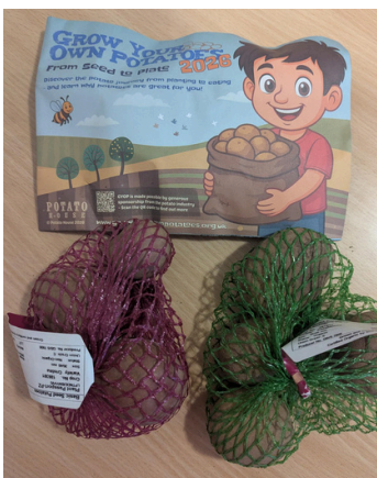
They have arrived!