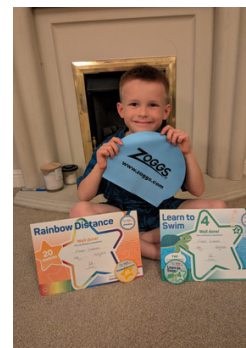
Freddie S (Cl 6) has moved up to Stage 5 in Swimming. He has worked really hard and is becoming a really strong swimmer.